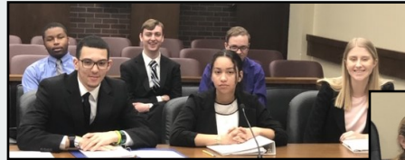
Team Green and Team Purple —Early College High School

All Deliberate Speed and Wisconsinite Glacier will compete in the State Competition on March 9 and 10 in Indianapolis!